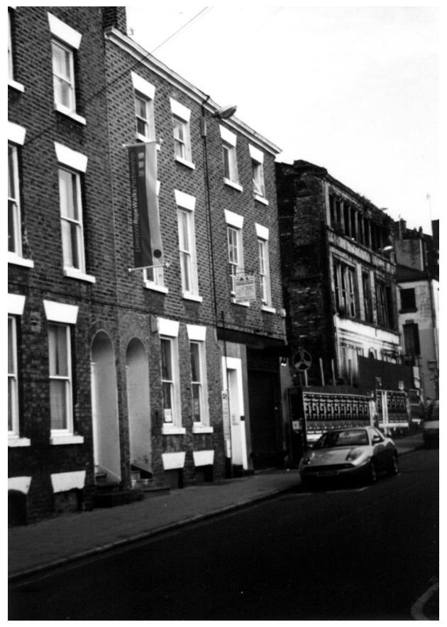
Figure 2 The Ropewalks Partnership offices in refurbished premises on Slater Street. Note the derelict building beyond

little attention to natural issues such as habitats for vegetation and wildlife, water balance and "greening" of the area. It seems entirely possible that the development and public realm proposals will increase hard surfaces in the area rather than facilitate water run off and that the redevelopment of derelict land will remove some existing (albeit unsightly and unprofitable) wildlife habitats.